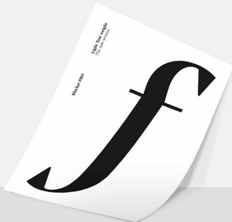
Blacker PRO Light Text version